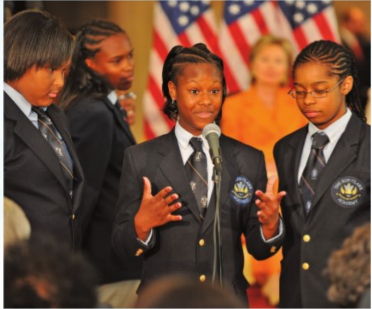
Ron Clark Academy Students