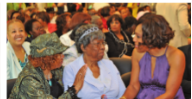
Dawnn Lewis, Actress and NCBW Members