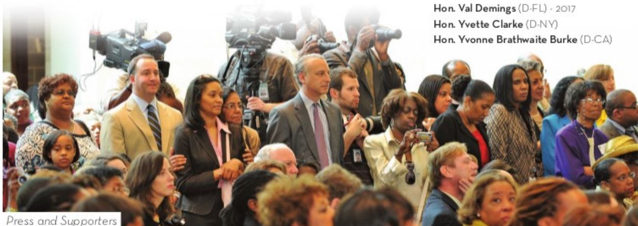
Press and Supporters

Hon. Barbara Lee (D-CA) Hon. Bonnie Watson Coleman (D-NJ) Hon. Brenda Lawrence (D-MI) Hon. Carolyn Cheeks Kilpatrick (D-MI) Hon. Carrie P. Meek (D-FL) Hon. Corrine Brown (D-FL) Hon. Cynthia McKinney (D-GA) Hon. Denise Majette (D-GA) Hon. Diane Watson (D-CA) Hon. Donna Christian-Christensen (D-VI) Hon. Donna Edwards (D-MD) Hon. Eddie Bernice Johnson (D-TX) Hon. Eleanor Holmes Norton (D-DC) Hon. Eva M. Clayton (D-NC) Hon. Frederica Wilson (D-FL) Hon. Gwen Moore (D-WI) Hon. Joyce Beatty (D-OH) Hon. Juanita Millender-McDonald (D-CA) Hon. Julia Carson (D-IN) Hon. Kamala Harris (D-CA) - 2017 Hon. Karen Bass (D-OH) Hon. Katie Hall (D-IN) Hon. Laura Richardson (D-CA) Hon. Lisa Blunt Rochester (D-DE) - 2017 Hon. Marcia Fudge (D-OH) Hon. Maxine Waters (D-CA) Hon. Robin Kelly (D-IL) Hon. Sheila Jackson-Lee (D-TX) Hon. Stephanie Tubbs-Jones (D-OH) Hon. Terri Sewell (D-AL) Hon. Val Demings (D-FL) - 2017 Hon. Yvette Clarke (D-NY) Hon. Yvonne Brathwaite Burke (D-CA)