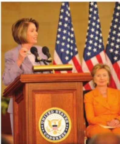
Nancy Pelosi, Former House Speaker (D-CA)

Improve and enhance conditions regarding women's health.