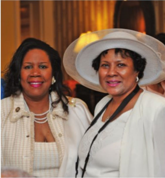
Congresswoman Sheila Jackson-Lee (D-TX)